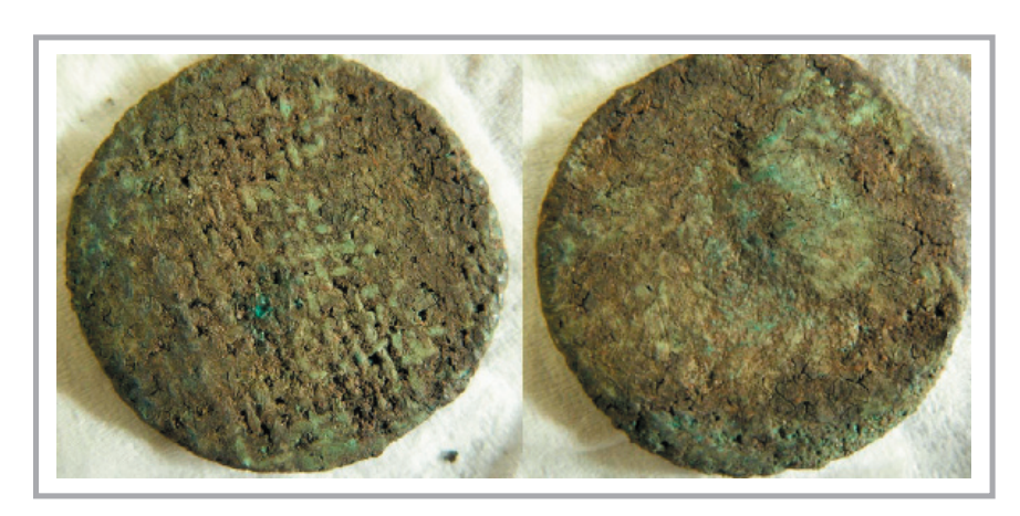
Figure 2. A sample of linen cloth from 17<sup>th</sup> century found in burial site near Rawa Mazowiecka, Poland.

While woollen fabrics can often be found in fairly good shape, linen finds are very rare. It is because animal fibres are made mainly of protein and therefore are more resistant to decay than vegetable fibres, which are composed of cellulose. Figure 1 presents a twill woven