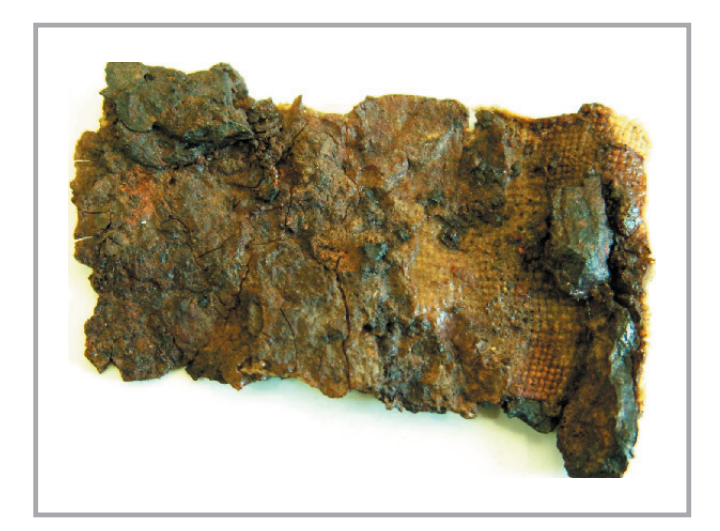
Figure 4. An iron chunk from a Merovingian burial site from 5th - 6th century, in St. Quentin, France.

Linen and other cellulose fibres preserve better in alkaline conditions, while animal protein fibres such as wool, preserve better in slightly acidic environments.