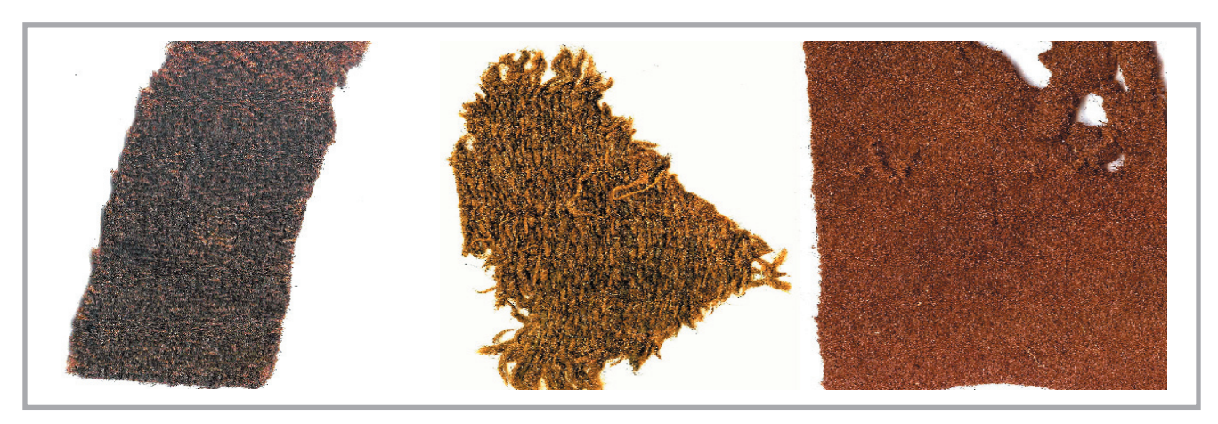
Figure 7. Medieval woollen fabrics from Kołobrzeg (on left), and Elbląg, Poland.