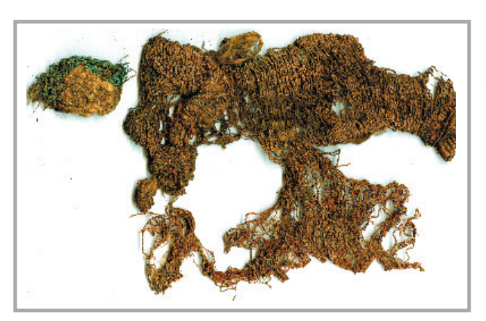
Figure 3. A fragment of chasuble, Tum near Łowicz, Poland.

fabric made from wool and linen from the 2<sup>th</sup> century from Leśno. One can see well preserved woollen threads and small residues of linen, almost completely biodeteriorated [7].