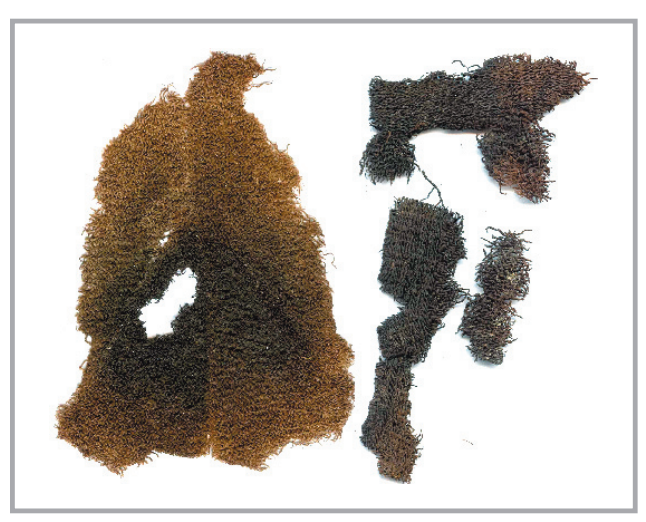
Figure 5. Roman Period textiles, Nowy Łowicz, Poland. Examples of textiles from Roman periot, Nowy Łowicz, Poland.