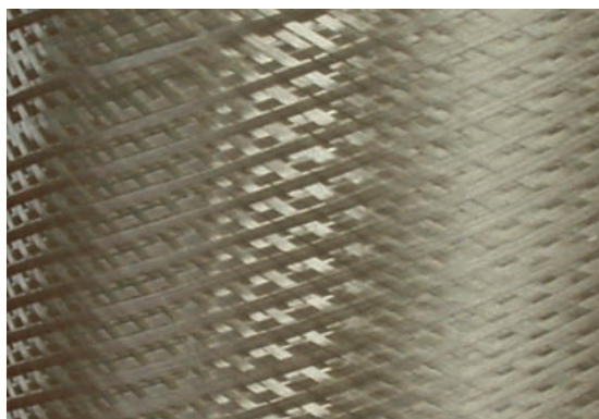
Multifilament chitosan yarn