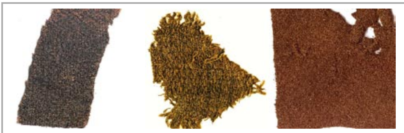
Figure 7. Medieval woollen fabrics from Kolobrzeg (on left), and Elbląg, Poland.