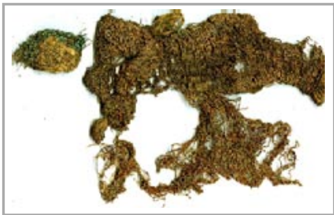
Figure 3. A fragment of chasuble, Tum near Łowicz, Poland.

fabric made from wool and linen from the 2 nd century from Leśno. One can see well preserved woollen threads and small residues of linen, almost completely biodeteriorated [7].