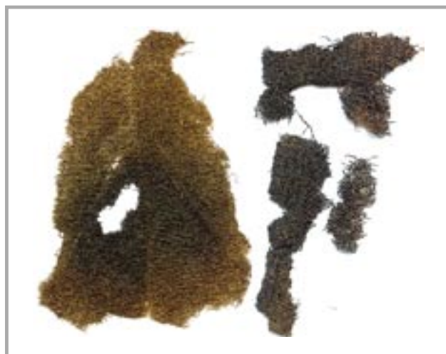
Figure 5. Roman Period textiles, Nowy Łowicz, Poland. Examples of textiles from Roman period, Nowy Łowicz, Poland.