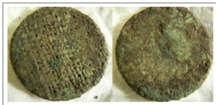
Figure 2. A sample of linen cloth from 17 th century found in burial site near Rawa Mazowiecka, Poland.

While woollen fabrics can often be found in fairly good shape, linen finds are very rare. It is because animal fibres are made mainly of protein and therefore are more resistant to decay than vegetable fibres, which are composed of cellulose. Figure 1 presents a twill woven