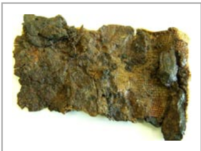
Figure 4. An iron chunk from a Merovingian burial site from 5 th - 6 th century, in St. Quentin, France.

Linen and other cellulose fibres preserve better in alkaline conditions, while animal protein fibres such as wool, preserve better in slightly acidic environments.