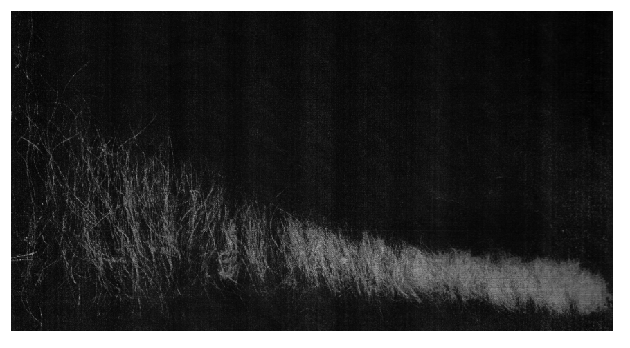
Figure 1. Distribution of fibres in the cottonised flax, mean fibre length -27.4 mm, fibre linear density -1.1 tex.

If the flax hackling noil is subjected to cottonising, it takes a form and shape that permit its processing in a blend with cotton by the cotton (rotor-spinning) system. The important properties here are the linear density and staple length of the cottonised fibre. In the spinning results discussed here, the material was mechanically cottonised flax.